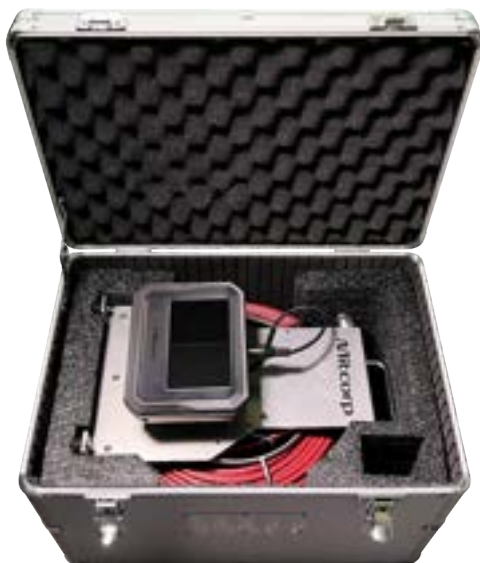
Aluminum carry case