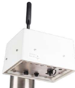
Pro version (Praxis/Urban)