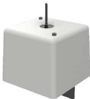
Standard version (Praxis/OPCube)